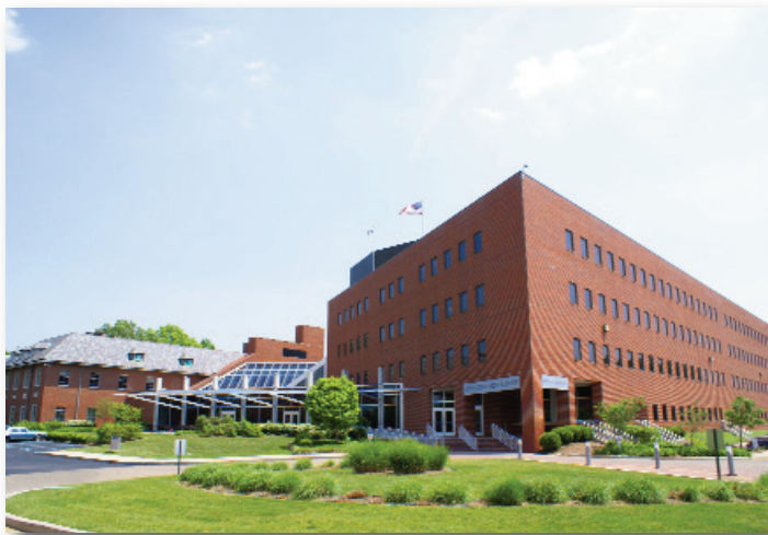
IMG World Headquarters, Indianapolis, Indiana

But providing insurance products - no matter how comprehensive - is not enough. It's how we administer your benefits and support your international needs that sets us apart. Since 1990, we've served more than a million people around the globe with customer service that's second to none. We provide on-site medical staff who are available 24 hours a day for emergencies, multilingual customer service professionals and dedicated claims administrators who process tens of thousands of claims each year from all over the world. We maintain IMG Europe Ltd. to provide the same world-class services abroad, with the added benefits of similar time zones and swift postal delivery. We've set the benchmark for industry service levels by integrating independent credentialing services with in-house, fully owned and operated service divisions. At IMG, we're with you, wherever you go - bringing support for all your insurance needs around the globe - providing you Global Peace of Mind®.